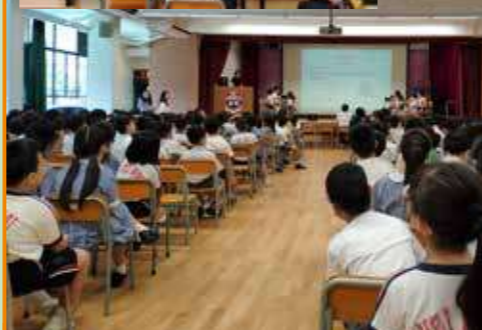
Students are engaged in the interesting but challenging tasks during English Competition.