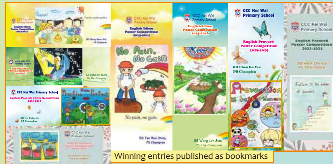
Winning entries published as bookmarks