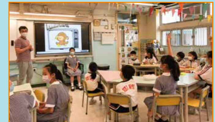
Student Enhancement Programme enables the appropriate students to realise their potential and enhance their academic experience.