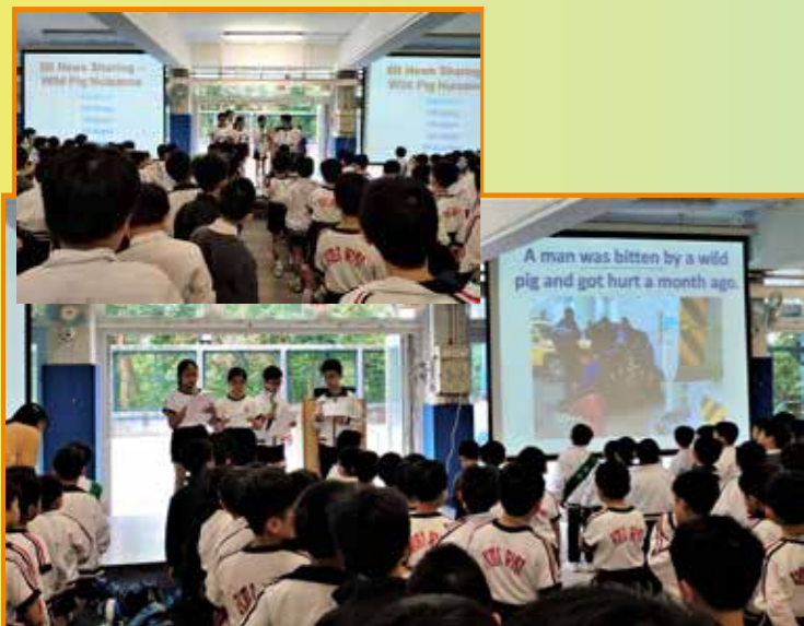
Senior students share some current issues with the whole school during morning assembly.