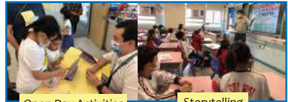
Open Day Activities