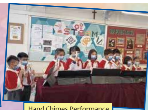
Hand Chimes Performance