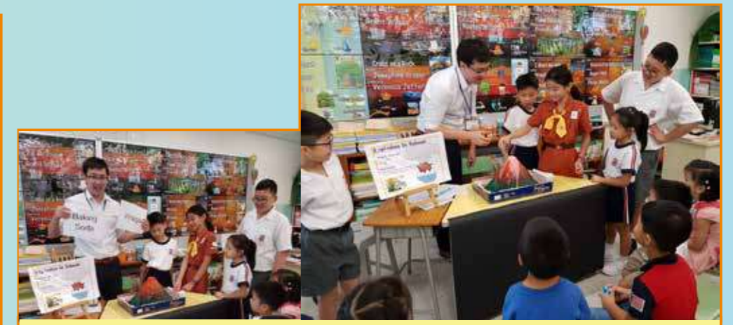
All the kids were watching the "Explosing in School" experiment attentively on the STEAM Day.