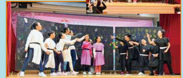
The students develop drama skills to perform on stage in front of an audience.