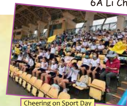
Cheering on Sport Day