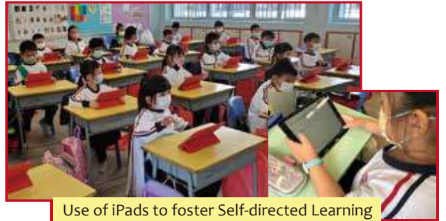
Use of iPads to foster Self-directed Learning