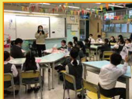
English Ambassador training

Students practise spoken English using English Passbook with Ambassadors on English Speaking Day.