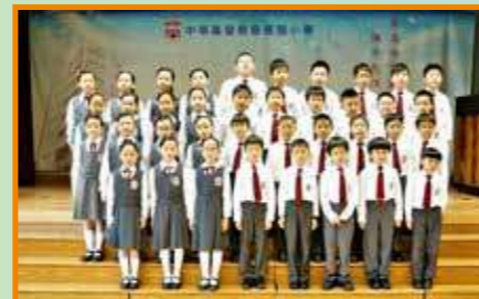
English Choral Speaking and Harmonic Speaking Competition