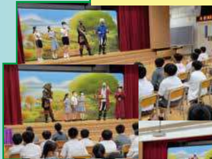
Drama 'Robin Hood' in 2022

With the fascinating plots, the interactive drama performances made the shows come alive and caught the attention of all students! While having a wonderful time watching the entertaining musical drama, students were exposed to English classic literature at the same time.