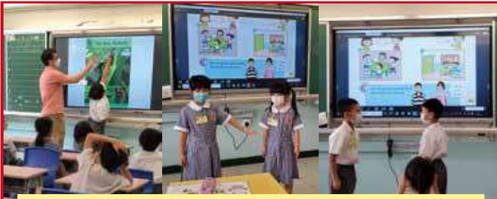
Interactive learning with interactive touch screen in classrooms

With the aim of sustaining the development of self-directed learning , we integrate the flipped classroom approach and e-learning strategies in daily teaching and utilise lesson time flexibly. Our curriculum also uses information technology to support learning and elevate learning effectiveness at the different phases of the lessons.